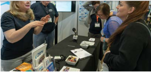
7 different cities and regions, including Newcastle.